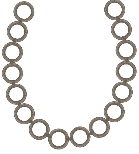
36.5" (92.5cm) Carnegie Hall Ring Holdback is available in Powder White, Chromium, Fawn, Raven, Tinsel, and Antique Gold

Shown on cover from left to right: Le Cirque Embroidered Border in Moonstone, Sage and Slate.